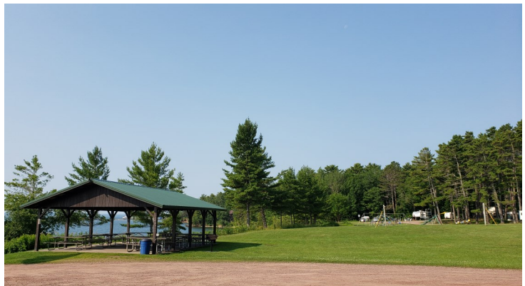
Memorial Park in Washburn

Sunday, July 14, 10 a.m. at Memorial Park in Washburn Children's Chapel Service and Annual Brunch Picnic at 11 a.m. All are welcome to attend Children's Chapel, a unique adaptation of a service with each section designed for all ages OR join us at 11 a.m. for the annual potluck picnic. Bring a dish to pass, your own dinnerware, and enjoy conversation and fellowship.